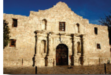
The Alamo in San Antonio