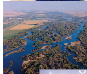
Nebraska’s Platte River will be featured as a case study.