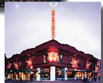
Enjoy a special evening at the Buckhorn Museum and Saloon.