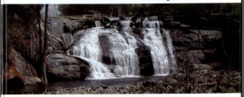
Case Studies, Science, Law, People, and Policy